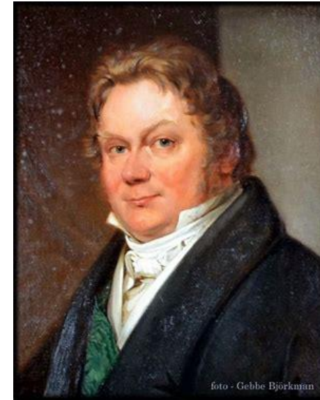
Jöns Jacob Berzélius